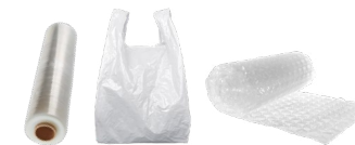
Stretchy Film Plastic Plástico de Película Estirable

Do not put these items in your gray cart: