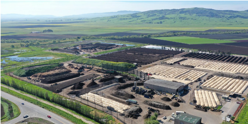
Photo: GreenWaste Z-Best Composting Facility in Gilroy, CA.

California Senate Bill 1383 (SB 1383) requires all Californians to divert organic materials from the landfill. In collaboration with the Town of Los Altos Hills, its residents and GreenWaste, the Town's sorting program is in compliance with SB 1383.