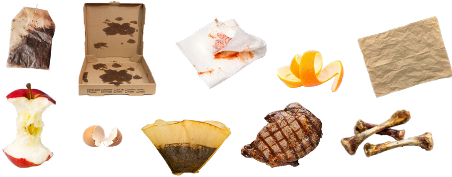
Food Scraps and Food Soiled Paper Comida y Papel Manchado de Comida