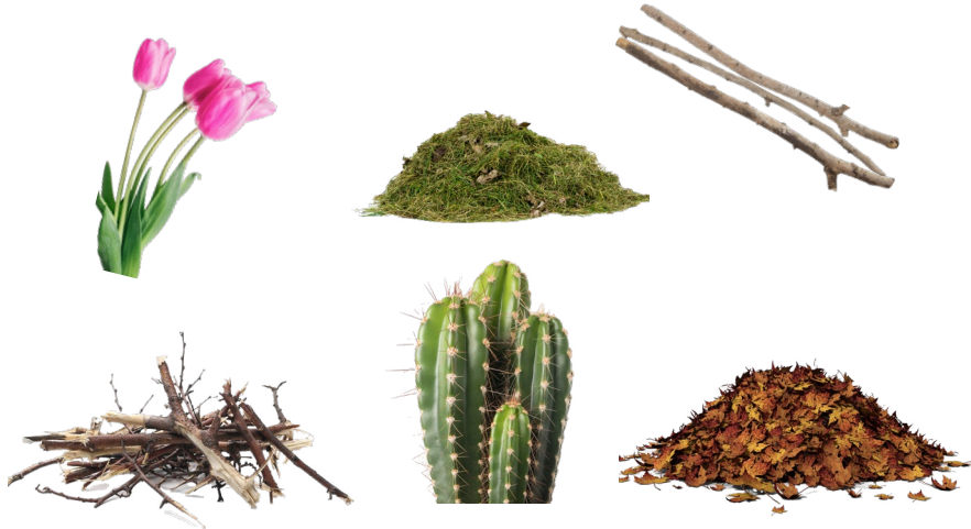
Yard Trimmings Recortes de Jardín

Note: If you do not have a green cart, place all yard trimming material in your gray cart.