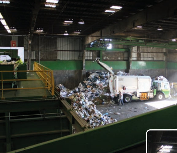
MSW is delivered to the tipping floor at the GreenWaste MRF (above). Mixed paper and other lightweight organic materials are separated from recyclable containers at the polishing screen on the MSW line (right).

The MSW line at the materials recovery facility is designed to process 25 tons/hour.